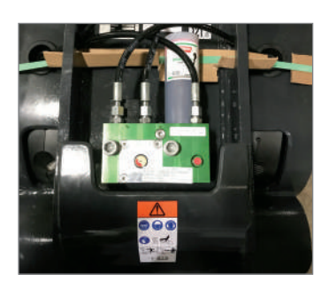
Automatic greasing system Standard on all JMHB130H and all larger models