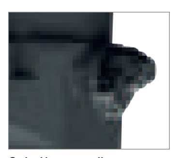
Swivel hose coupling Extends hose life