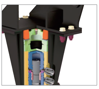
Hydraulic accumulator Constant power over time